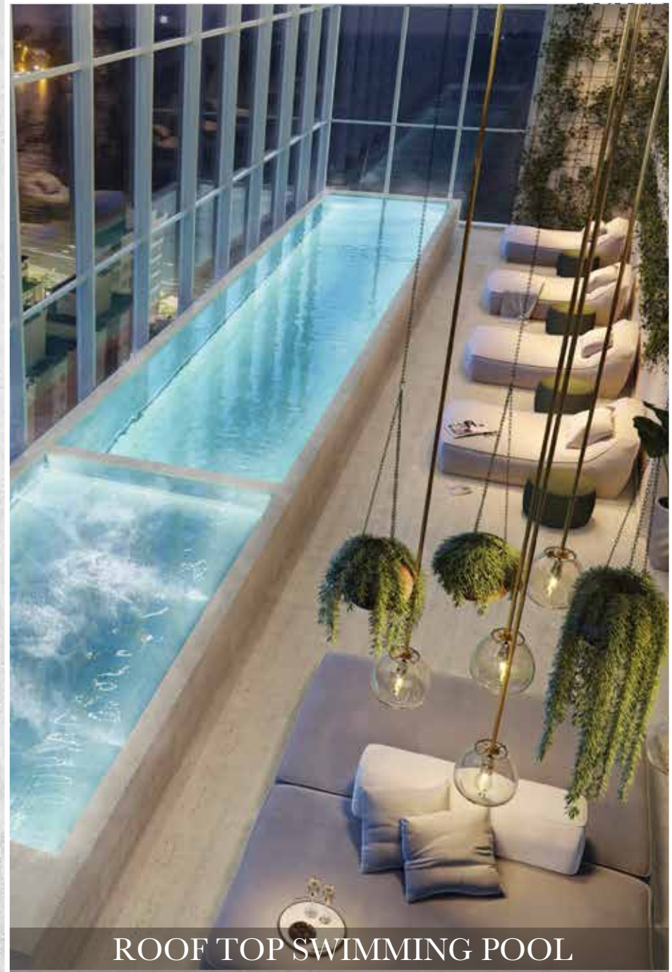
ROOF TOP SWIMMING POOL

*DISCLAIMER: IMAGES ARE FOR ILLUSTRATIVE PURPOSES ONLY AND ARE NOT ORIGINAL.